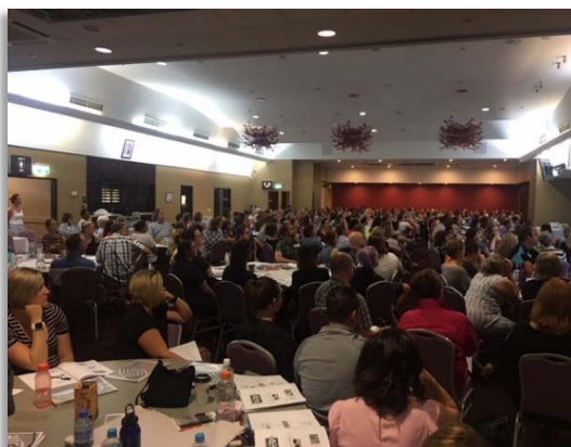
Staff at our recent Staff Development Day

What a privilege to commence 2018 with passionate colleagues from other schools at the Visible Wellbeing training day 1.