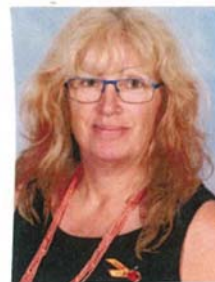
Year 11 - Assistant Year Advisor