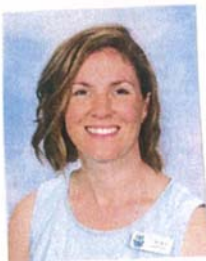
Year 11 - Year Advisor