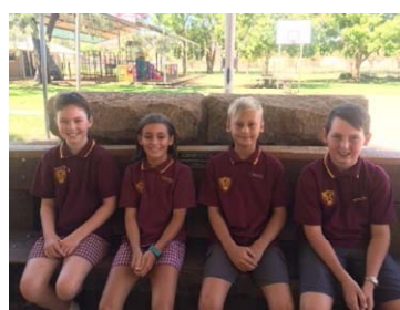
Students of Denman and Martindale Public School