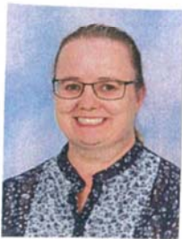
Year 12 - Year Advisor