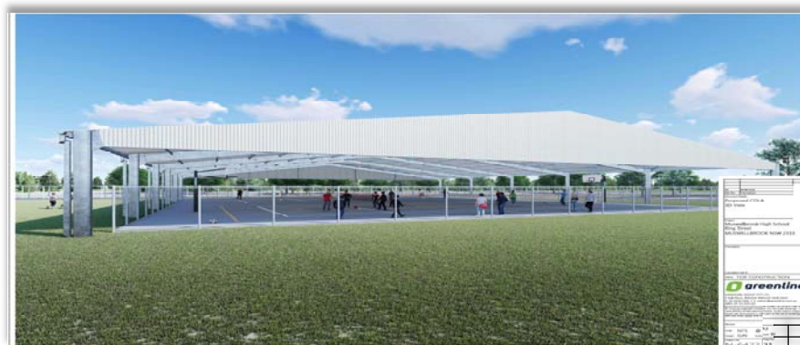
An Architectural Image on the new COLA

The work on the COLA covering the double basketball courts is on track to commence this Term. This massive structure will provide much needed all weather activities area for our students as well as essential shade for the playground.