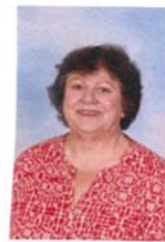
Prep room co-ordinator