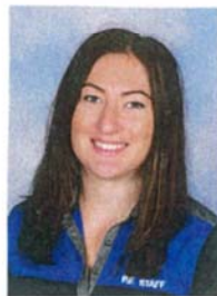
Year 12 - Assistant Year Advisor