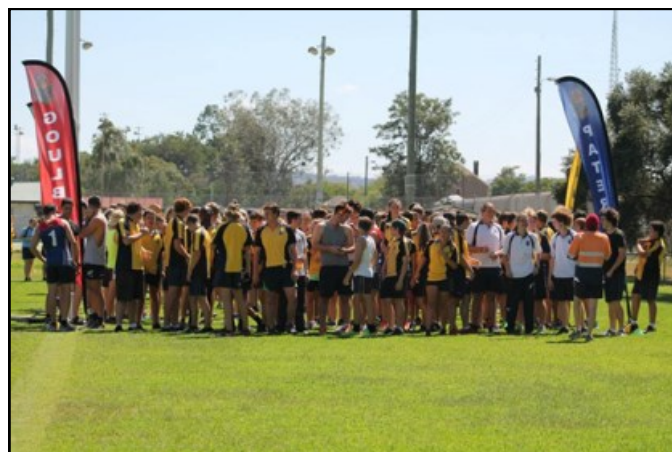
Above: Eager to start the senior race