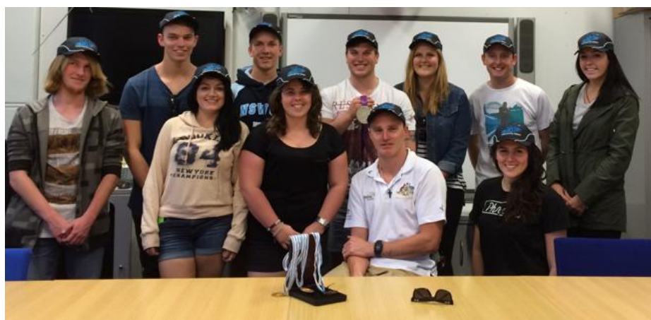
HSC PDHPE Class with Paralympic Silver Medallist and World Champion Rower Erik Horrie

The next stop was at the NSW Combined High Schools State Sport Office in Blacktown for a special guest presentation from Australian Paralympian Erik Horrie. Erik inspired the class with his story of challenges throughout his life, particularly being confined to a wheelchair following a motor vehicle accident shortly after leaving school. His resilience and capacity to turn a negative situation into multiple World Championships for rowing as well as Paralympic Silver, demonstrated to the students that life will have its hurdles and that an individual's capacity to overcome these, while putting specific processes in place, can lead to success.